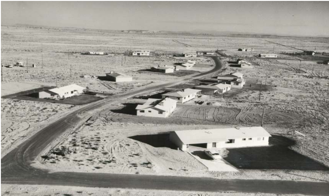
Looking north from the intersection of 23 rd Avenue SE and Leonard St. SE (1964-65).

1981, AMREP began promoting economic development to provide a more favorable jobs/housing balance for the area and an economic base to generate high paying jobs and tax revenues for the growing city. In 1980, the City had 1,500 jobs, less than one third of which were economic base jobs that export goods and services out of the area and bring in money. By 2000, employment in the City had increased to over 19,000 jobs, over 10,000 of which were in the economic base category.