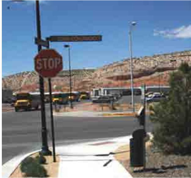
Providing pet waste stations along sidewalks helps maintain an attractive landscape design.