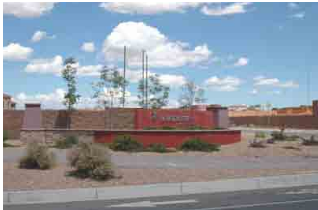
Provide enhanced subdivision entries to carry a complete street concept from a residential subdivision to collector and arterial roads.