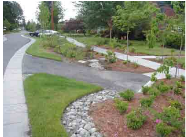
LID below street-level water is retained on-site.

Urban design can also occur in the form of storm water management. One method of storm water management is Low Impact Development. A LID is an innovative storm water management, ecosystem-based approach with a basic principle that is modeled after nature. LID's goal is to mimic a site's predevelopment hydrology by using design techniques that permit infiltration, filter, store, evaporate, and detain runoff close to its source. Techniques are based on the premise that storm water management should not be seen as storm water disposal. LID is a versatile approach that can be applied equally well to new development, urban retrofits, and redevelopment/revitalization projects. Low Impact Development is an environmentally sound technology and an economically sustainable approach to addressing the adverse impacts of urbanization. By managing runoff close to its source, LID can enhance the local environment, protect public health, and improve community livability.