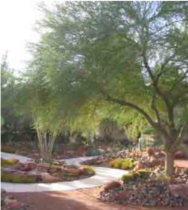
Xeriscape can provide a lush and dense tree canopy.