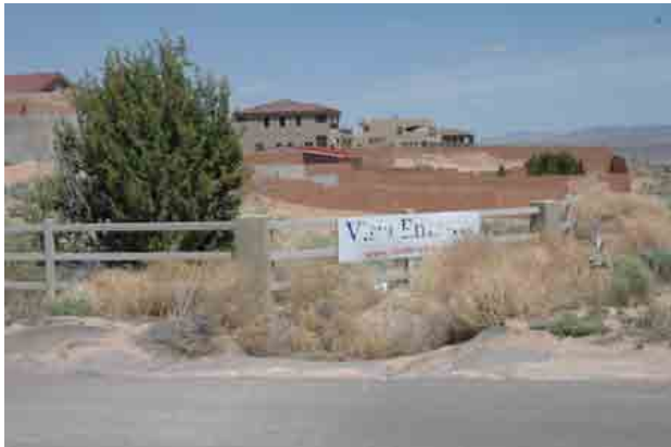
Subdivision entries shall manicured with signs made of permanent materials.