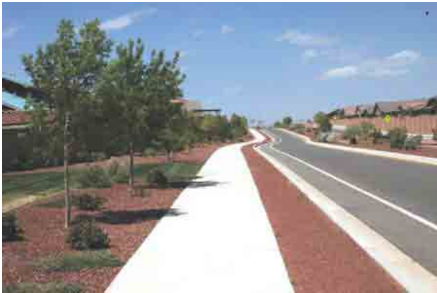
Separate the sidewalk from the curb, but also landscape the space between the sidewalk and curb.