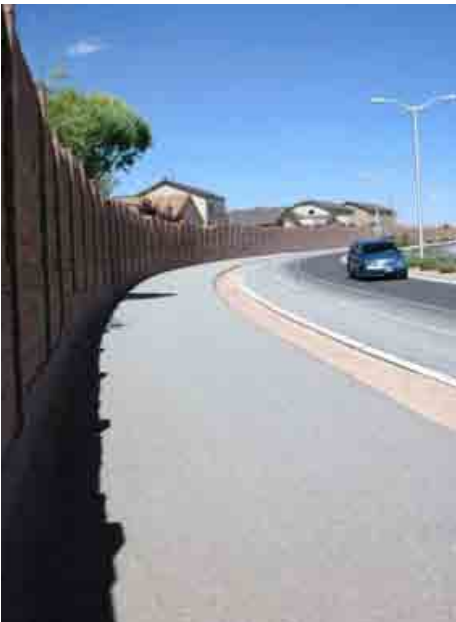
Currently King Boulevard in Northern Meadows is not inviting to pedestrians with tall subdivision walls and a lack of landscaping.