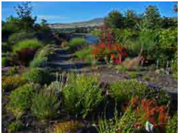
Xeriscape can be colorful and water efficient.