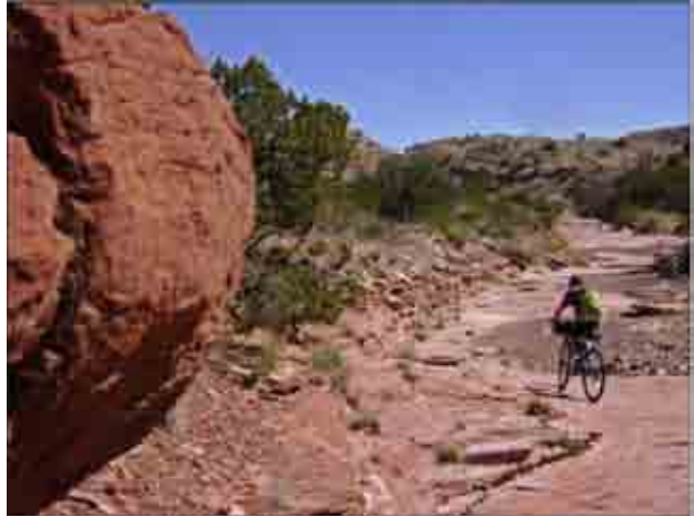
Albuquerque Arroyo Trail

By decreasing the amount of water used outdoors through the use of xeriscape landscaping choices, the amount of water consumption and runoff can decrease, allowing the salvaged water to be reallocated for non-consumptive uses. Poor landscape choices in new and existing communities result in an unnecessary usage of water resources and a decreased potential for return-flow credits. Also, communities’ overuse of impermeable surfaces, “hardscape,” such as parking lots and sidewalks affects Rio Ranchos’ water supply by contributing to runoff and water waste. Hardscape surfaces seal the soil surface and do not allow fluids to pass through them. Hardscape stops water infiltration, contributes to water runoff, and hinders natural groundwater recharge.