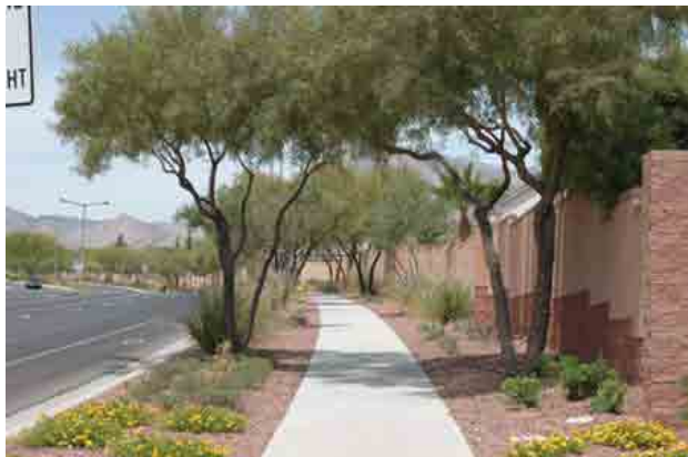
Wide landscape buffers between the curb and sidewalk as well as between a subdivision wall and the sidewalk creates a more secure environment for a pedestrian.