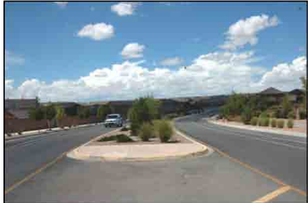
Complete streets have well landscaped sidewalks as well as street medians.