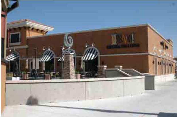
Incorporating outside dining and public spaces adjacent to a sidewalk creates third places that foster human interaction.