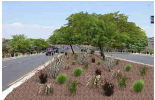
Landscaping placed adjacent to the walking trail at Cabezon creates shade relief during hot summer days, while landscaping the median of Unser Boulevard projects the importance of this corridor road.