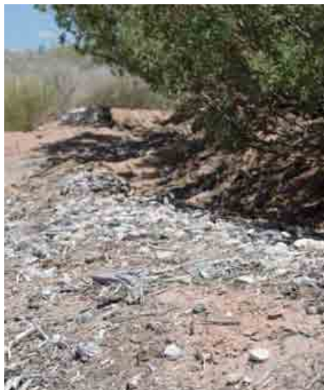
Straw bales, wood mulch and water collection areas allow the property owner to use less irrigation in this landscape.