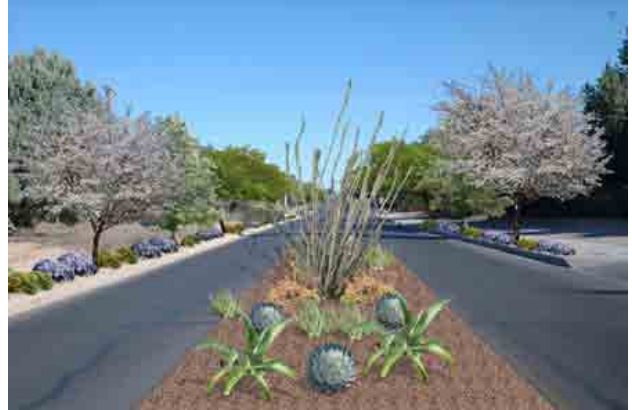
Incorporating landscaping within medians and along the street frontage and the creation of a trail along Sara Road will create an inviting pedestrian environment.