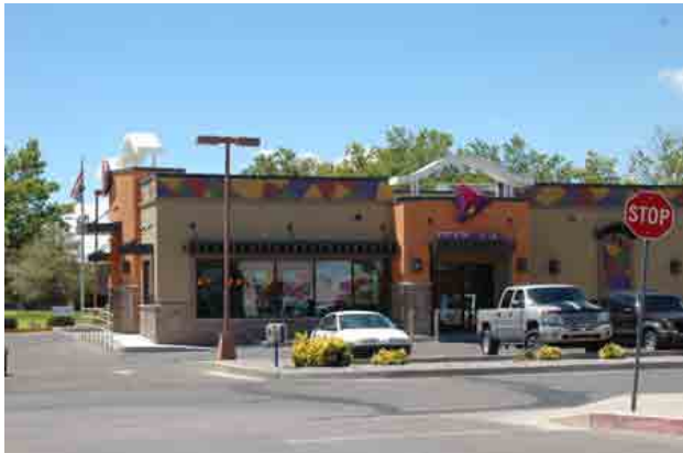
Screen roof-mounted mechanical equipment from view with the use of parapet walls.