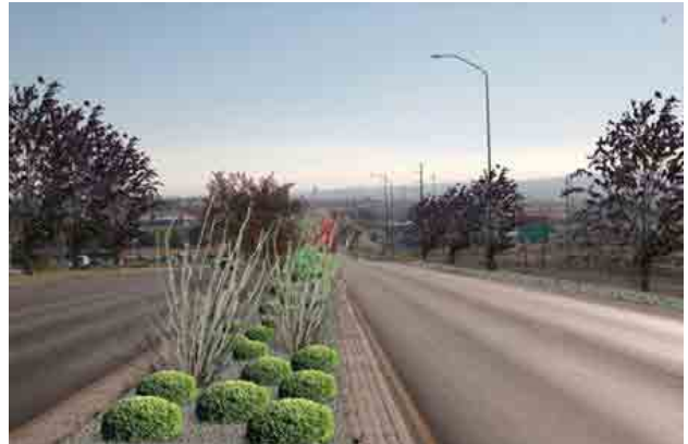
Landscaping the median and the edge of the right-of-way along New Mexico Highway 528 is important to defining this corridor to provide an image the City desires.