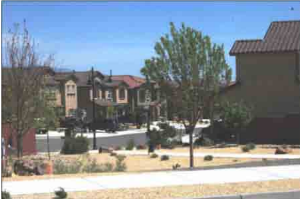
Integrating pedestrian connections at the bulb of a cul-de-sac promotes a walkable environment.