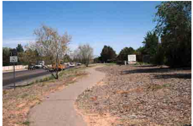
Weed barriers and rock mulch shall be located in areas where vegetation is absent.