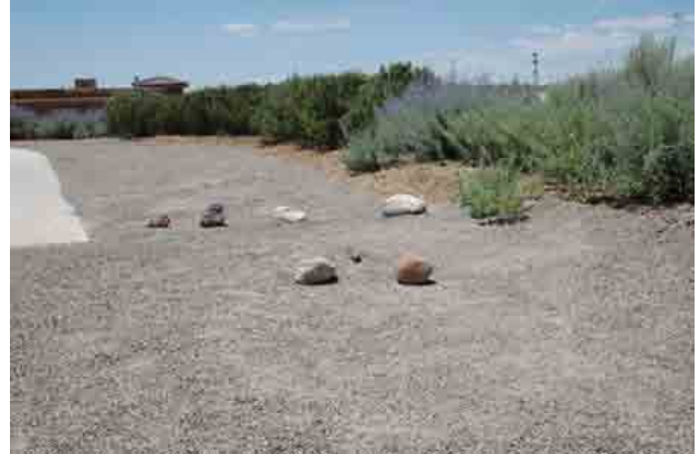
Incorporating straw bales and wood mulch increases the water holding capacity of a landscape area and provides a water source for landscaping long after a rainfall.