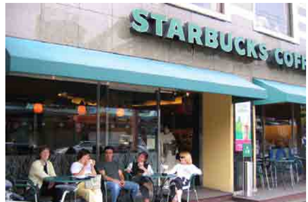
Coffee Shop Street Scene