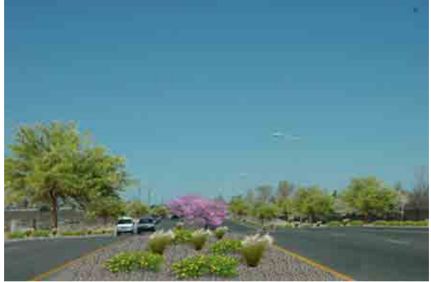
What Unser Boulevard could look like with landscape enhancements.