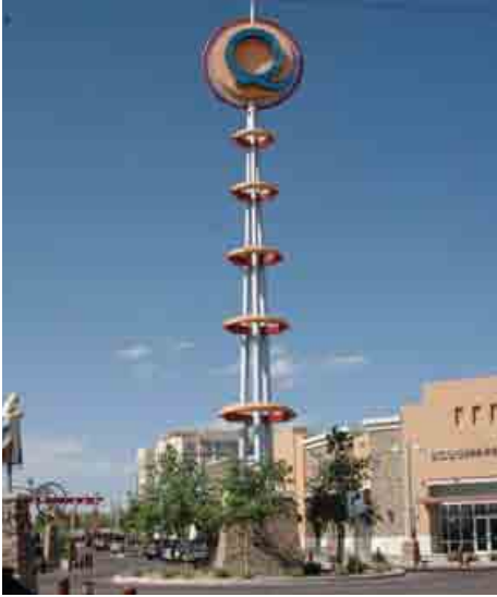
Good site design incorporates identifying monuments to create a sense of place.