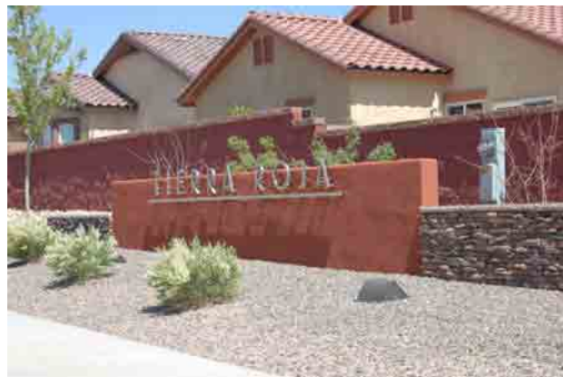
Integrate subdivision signs into the wall design to create a sense of place.