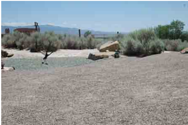
Small undulations in landscape design slows surface flow rates and reduces the risk of washout of soil downstream.