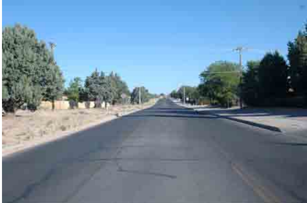
Sara Road currently has an excess right-of-way that is left undeveloped.