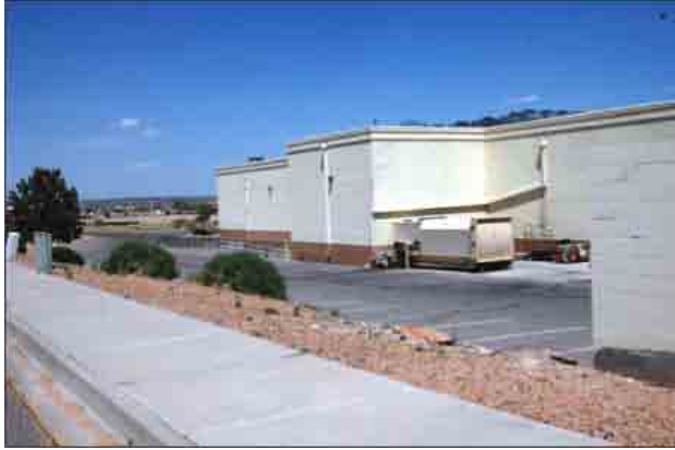
Trash compactors and untreated walls shall not be visible from the right-of-way.