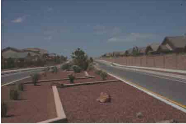
Well landscaped medians along collector and arterial roads develop a sense of place and can provide a refuge where mid-block crossings exist.