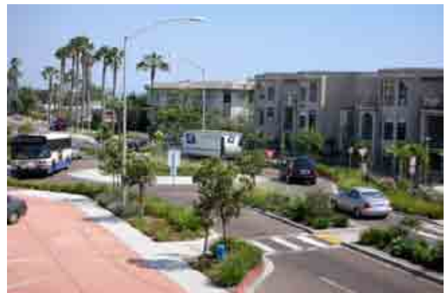
Infill/Redevelopment foreground scaled to fit in with older development background.

Infill development should be compatible with existing development. The new building or buildings should be similar in proportion, height and setbacks to surrounding buildings, to create a visually organized development and to promote pedestrian activity. Additionally, development should be compatible with the street hierarchy. For instance, higher density development is more appropriate for arterials, whereas lower density might be more appropriate on local streets designed for a lower traffic volumes and speeds.