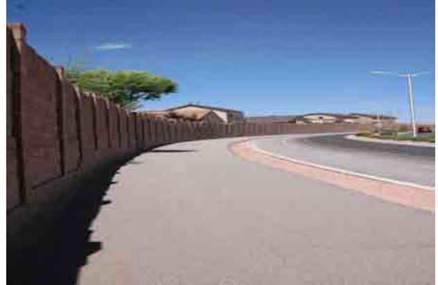
Landscaping with trees shall be located along both sides of a sidewalk and walls greater than eight feet in height shall be stepped with a five-foot horizontal offset with landscaping in the offset.