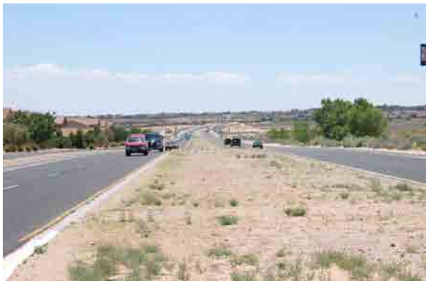
The walking trail at Cabezon provides a great amenity for Rio Rancho residents; however, there is a lack of shade along the trail which discourages use of the trail in hot weather. The median of Unser Boulevard, south of Southern Boulevard is an important corridor into the City.