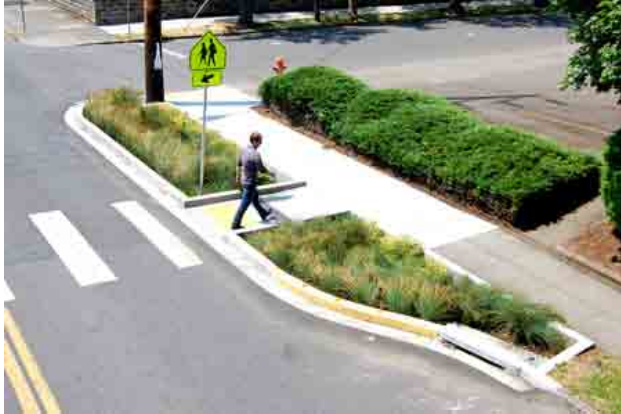
Complete street w/bulbout shortens walking distance to cross street.

It is important to create roads and streetscapes with the pedestrian in mind, and encourage human scale design to form a walkable community. A key element to create a well rounded streetscape that promotes pedestrian activity is the creation of narrower streets, which in turn slows traffic and increases pedestrian safety, likewise broader landscape buffers and sidewalks can create the same sense of safety for pedestrians along streets with higher speed limits and traffic volumes.