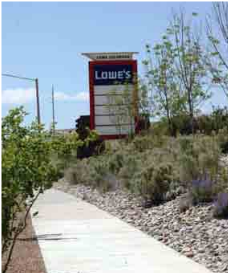
Using multi-tenant signs reduces sign clutter and promotes good site design.