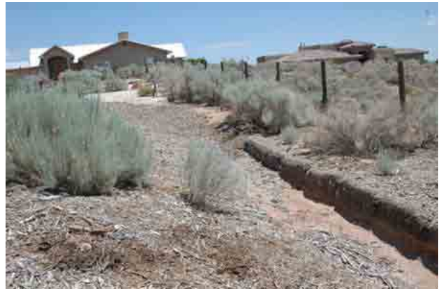
Straw bales, wood mulch and undulating the land allows water to slowly enter this water collection area to protect downstream properties from increased flow rates.