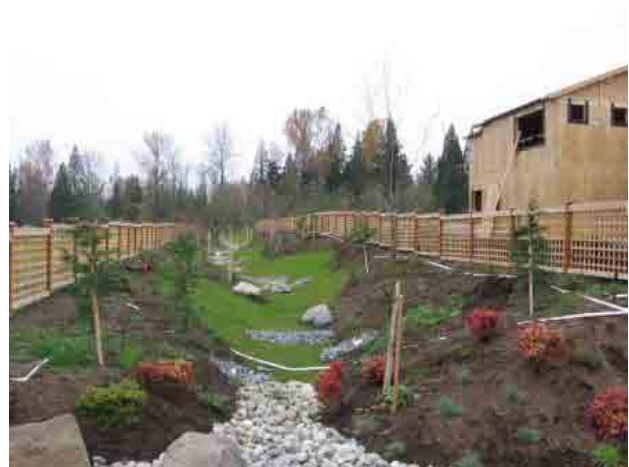
LID swale water is retained on-site.