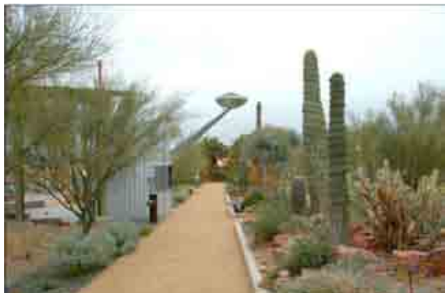
Xeriscape Las Vegas Springs Preserve