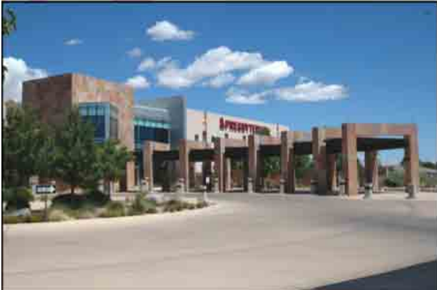
Incorporate different textures, vertical and horizontal planes into buildings to create visual interest.