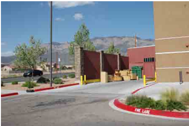
Screening loading areas from streets with decorative walls promotes good site design.