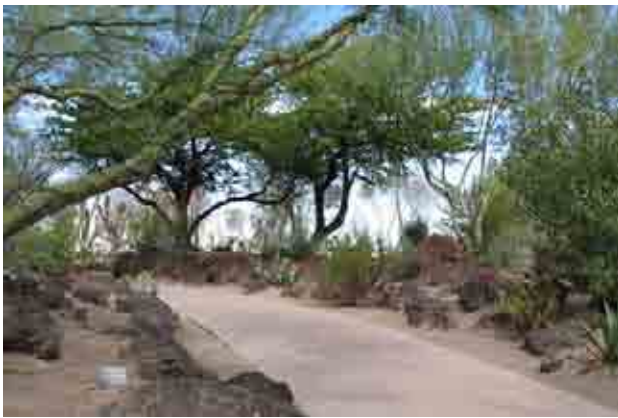
Ethel M Desert Garden Las Vegas, NV

Trees can benefit a community in many ways. As a city grows, community, urban forests can provide for economic revitalization, resolution of development issues, and an increased quality of life. In desert regions, the urban forest canopy remains a distinctive feature of the landscape that provides residents protection from the elements and forms a living connection to earlier generations that planted and tended the trees. Trees aid by conserving energy, reducing atmospheric carbon dioxide, improving air quality, reducing storm water runoff, increasing property values, and contributing to human health.