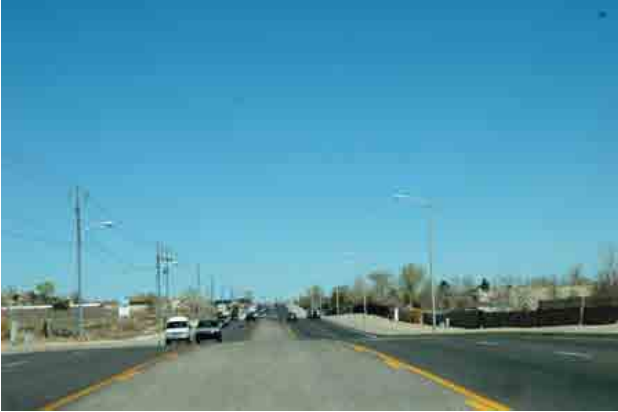
Current look of Unser Boulevard, south of Abrazo Road.