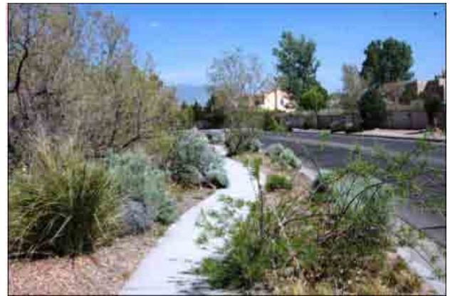
Overgrown landscaping inhibits sidewalk use and cactus should not be located within three feet of a sidewalk.