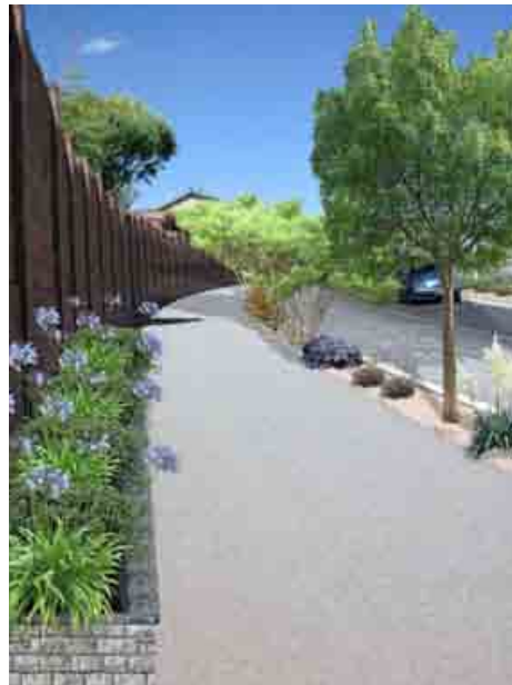
With landscape enhancements like planter walls to break up the height of the subdivision wall and street plantings, King Boulevard become more pedestrian-friendly