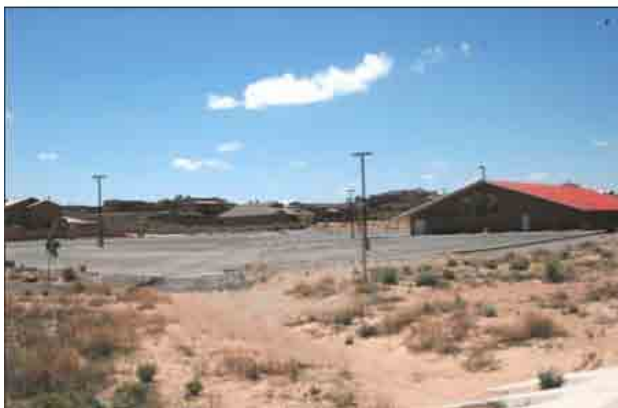
Parking lots without landscaping increase surface temperatures which promotes an urban heat island.