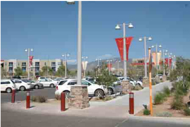
Incorporate pedestrian connections between commercial and residential developments to promote walkability.