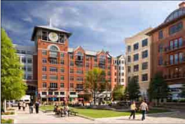
Example of TND with retail on ground floor, residential above, and public plaza.

range of housing and business choices. The inclusion of civic buildings and civic space – in the form of plazas, greens, parks and squares – enhances community identity and value.