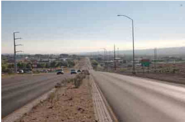
New Mexico Highway 528 is a major corridor for the City of Rio Rancho. With the exception of a portion of New Mexico Highway 528 from Westside Boulevard to Southern Boulevard, there isn't landscape treatment in the medians and the edge of the right-of-way.