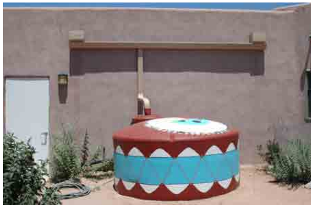
Incorporate water collection systems into the roof design to reduce amount of water used for landscape irrigation.