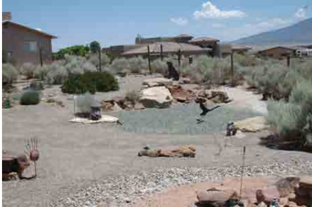
Depressions and swales in a landscape design help retain water on-site and to reduce water concentration downstream.