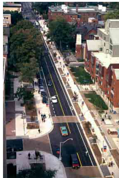
Complete Street w/defined crosswalks, bike lanes and broad sidewalks.

Streetscapes can improve the pedestrian experience by creating a safe environment that is both pleasant convenient. Well designed streetscapes can also increase the commercial viability of a community and provide a unified design that can carry people through and to the area. An inviting, aesthetically pleasing streetscape has the opportunity to create a walkable, pedestrian friendly community.