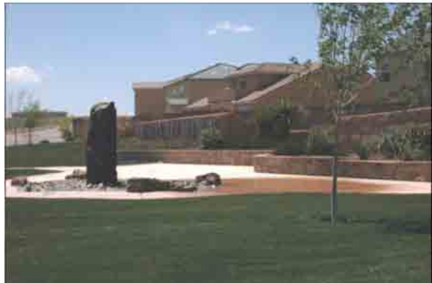
Provide subdivision entry features that create a sense of place; however, minimize the use of turf and water features.